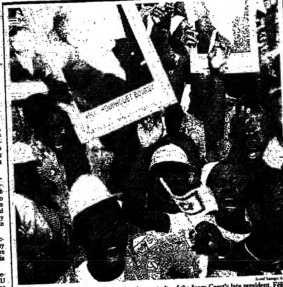
ADIEU TO PRESIDENT — People waving portraits of the Ivory Coast's late president, Félix Houphouët-Boigny, waited to view his coffin in Yamoussoukro, his birthplace, on Sunday. The funeral services for Mr. Houphouët-Boigny, who died Dec. 7 at age 88, will be held on Monday.

Mr. Ahtisaari will become Finland's third president since 1956 and the 10th since the Nordic country won its independence from Russia in 1917.